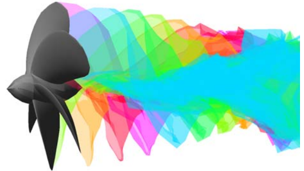
Propeller Wake Development

Analytical Methods, Inc. 2133 152nd Avenue NE Redmond, WA 98052